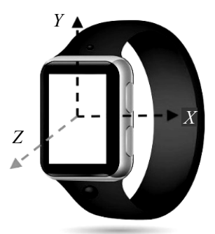
Fig. 1. Accelerometer axis demonstration on the general smartwatch/bracelet [12]

An accelerometer measures changes in velocity along one axis (Fig.1). The